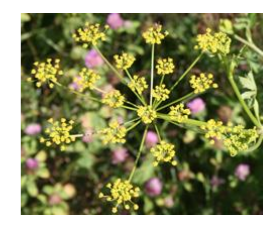
Figure 12 wild parsnip flowers

The concern over this plant is two-fold. It is an aggressive plant that produces large numbers of seed. It is showing up as large colonies along roadsides and in other out-of-the-way places. I have also seen it in State parks and other native areas (wild parsnip is a non-native