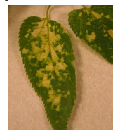
Figure 11 Island chlorosis on hackberry

deficiencies. Island chlorosis is thought to be caused by a virus and is showing up on hackberry ( Celtis occidentalis ) at The Morton Arboretum. The symptoms of the viral infection are a mosaic pattern of spots of light green or tan tissue between veins (fig. 11) and some marginal necrosis. The interesting thing about viral infections is that the virus does not want to kill the host, because it needs the host in order to reproduce, but it does make the host weaker and more susceptible to other infections. Since viruses are unable to move on their own, they rely on vectors to move them around. The vectors may be insects, humans, or anything else that can carry the viral particle and create a piercing wound into the host. The only way to prevent a viral disease is to control the vector. Once the