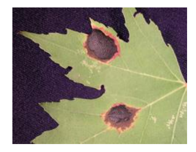
Figure 9 tar spot with red ring

http://www.mortonarb.org/trees-plants/tree-and-plant-advice/help-diseases/tar-spot-maple-rhytisma-spp