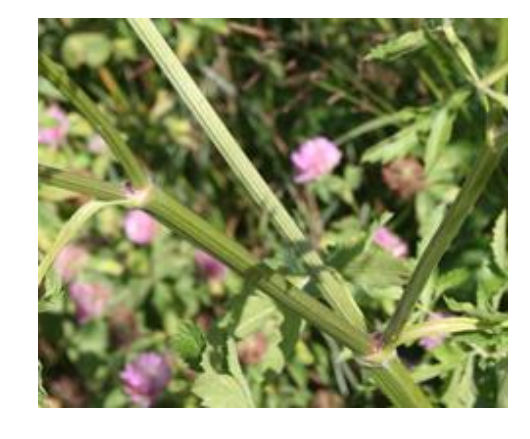
Figure 13 wild parsnip stem

Learn to recognize this plant. It is in the carrot family and will have a flower cluster (umbel) similar to that of Queen Anne's lace, but the flowers will be yellow (fig. 12). Flowering is most prominent in July. Plant size can range from 2 to 5 feet tall and the main stem is visibly grooved (fig. 13). The leaves are pinnately compound and can have 5