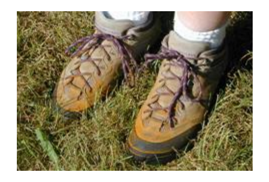
Figure 7 Rust spores on shoes

Management: There is no permanent shoe damage, and the orange spores can be easily wiped off. Lawn rust is usually not severe enough to warrant use of fungicides, and sound management practices will keep this disease in check. Management practices that spur a little growth will minimize rust. These practices include watering and fertilizing with nitrogen. While these practices may apply to a highly managed lawn, they may not be great for the average home lawn. Watering the lawn in summer is not really a priority since the lawn can go dormant and come back when the rain