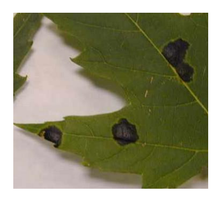
Figure 8 Tar spot

Tar spot of maple is showing up early this year (probably due to that rainy spring we had). We have had reports of it on Norway maple ( Acer platanoides ) and Freeman's maple ( Acer x freemanii ). In the early stage, the spots are yellowish with black specks in them and may go unnoticed. As the disease develops, the spots will look just like shiny black spots of tar flung about on the upper surface of maple leaves (fig. 8). We are already seeing this stage. Several different fungi in the genus Rhytisma infect the leaves of maples and cause the spots. The spots range from 1/5 to 4/5 inch in diameter. In some cases, a red ring surrounds the spot (fig. 9). Rhytisma spp. most commonly infect leaves of silver and Norway