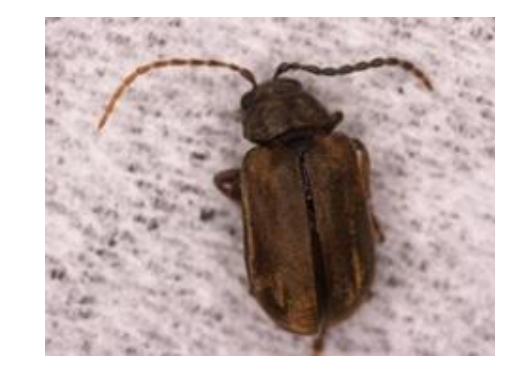
Figure 2 Viburnum leaf beetle adult

Adults emerge from the soil (early July) and chew on the leaves. Their feeding damage forms irregular round holes in the leaves. The beetles are about ¼ inch long and generally brown in color (fig. 2). On close inspection golden hairs can be seen on the wing covers of the adult beetle. The adult beetles will be mating and laying eggs from summer into fall. There is one generation of the beetle each year. Heavy and repeated