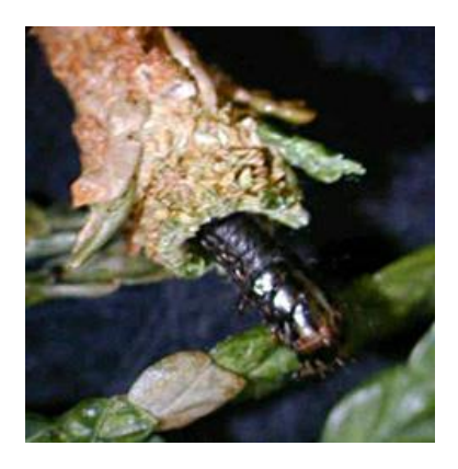
Figure 4 Bagworm caterpillar

top of the bags to feed and move (fig. 4). The feeding by young larvae results in holes in the foliage. As the larvae grow, they enlarge their bags and feed on the entire leaf, leaving only veins. Bagworm populations can build rapidly and quickly defoliate their hosts. Healthy deciduous trees can usually tolerate three consecutive years of severe defoliation before they are killed. Evergreen trees, on the other hand, are frequently killed by just one year of severe defoliation. Bagworm larvae feed on over 120 species of trees and shrubs. Their bags are made of the foliage they're feeding on, so a bagworm feeding on pine will have pine needles in its bag, while a bagworm feeding on a crabapple will have pieces of crabapple leaves decorating its bag.