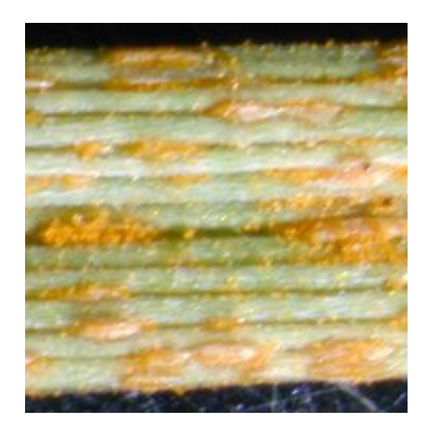
Figure 6 spores of lawn rust

Initial symptoms of rust disease include yellow lesions on grass blades that enlarge over time and rupture to release orange spores (fig.6). When you walk across the lawn, your shoes pick up the orange spores and turn orange (fig. 7). The spores are wind-blown and splashed by rain to new infection sites on grass.