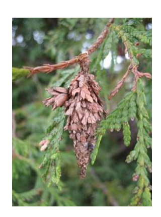
Figure 3 bagworm

Bagworms ( Thyridopteryx ephemeraeformis ) have been reported to the Plant Clinic this week. Bagworms overwinter as eggs inside the female bag. The bag can contain between 300 and 1,000 eggs. The eggs hatch in early summer, and the young larvae suspend from a silk string and are often "ballooned" by wind to nearby plants. When a suitable host plant is found, larvae begin to form bags over their bodies. They move to a sturdy branch, attach the bag with a strong band of silk, and then pupate. By mid-August the larvae have matured and are 1 to 1-1/2 inches in length, and their completed bags are 1-1/2 to 2-1/2 inches long. About four weeks later, adults emerge and mate. The sedentary female, which has no eyes, wings,