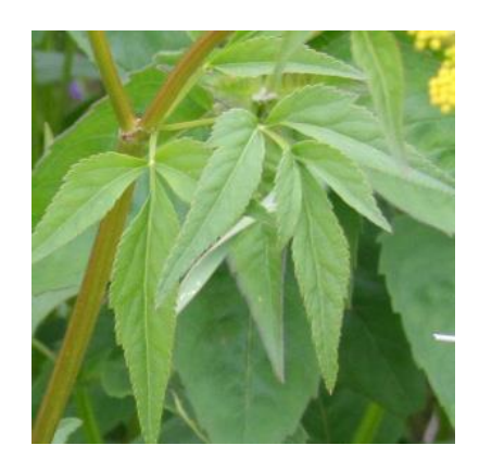
Figure 15 leaves of golden Alexanders

http://www.dot.state.mn.us/adopt/documents/wild-parsnips.pdf http://www.illinoiswildflowers.info/weeds/plants/wild_parsnip.htm