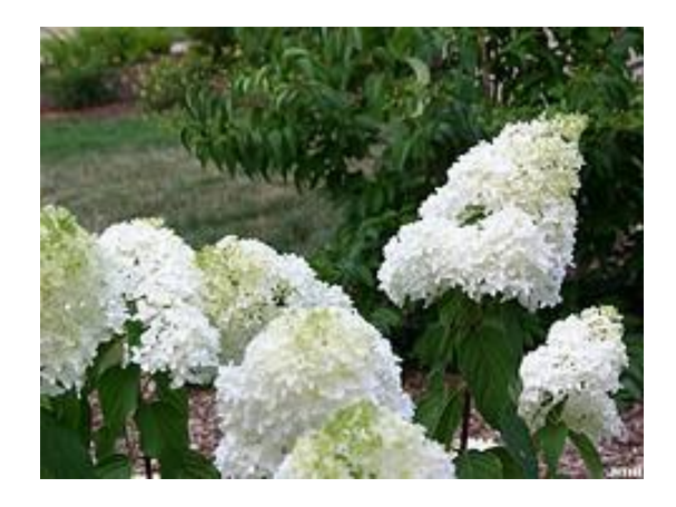
Figure 1 Panicled hydrangea